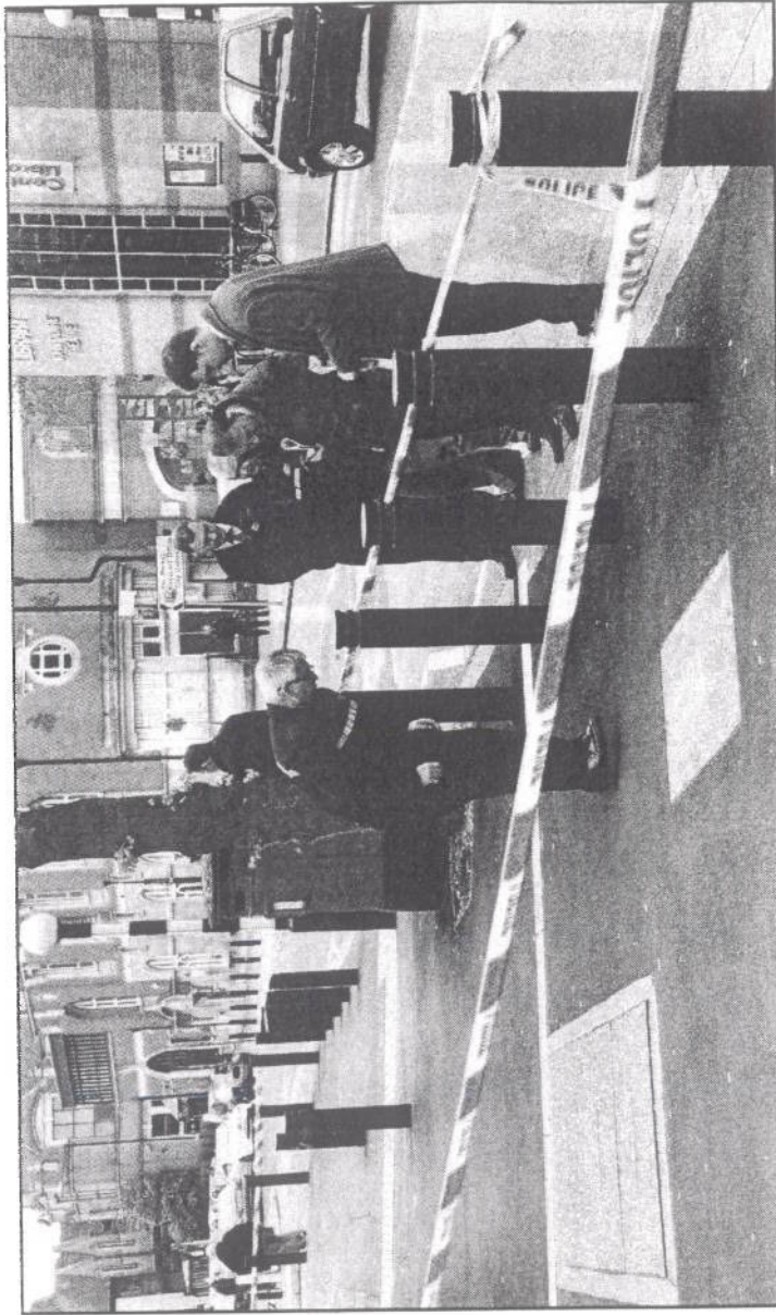
PROBE: Police investigate the scene outside Coco after an alleged assault yesterday morning.

"A 23, 21, 20 and two 19-year-old men were arrested on suspicion of